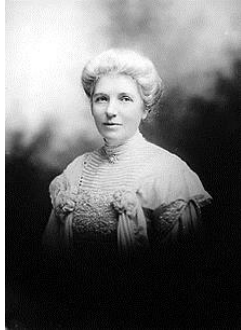
Kate Sheppard (1847-1934)

Katherine Wilson Sheppard , also known as Kate, was the most prominent member of NZ's women's suffrage and her work had a considerable impact on women's suffrage movements in other countries. Her image appears on the NZ ten-dollar note.