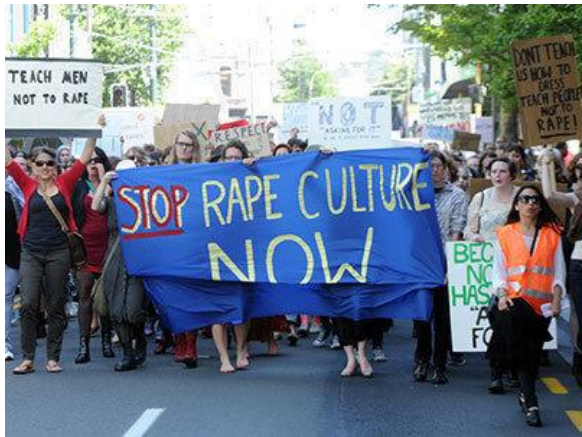
November 16, 2013. Nz.news.yahoo.com

Thousands of people, including SPCS members, marched at events in Auckland, Wellington, Christchurch, Dunedin, Hamilton and other centres on Saturday 16 November 2013 in a “Put a Stop to Rape Culture” protest, in response to media reports on alleged sexual offences committed by a West-Auckland teenage boy gang called the “Roast Busters”.